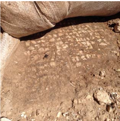
Tiles mentioned in Par. 1, and 1/9/14 newsletter