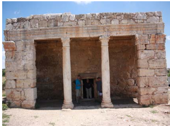
Mausoleum with Seth in the doorway