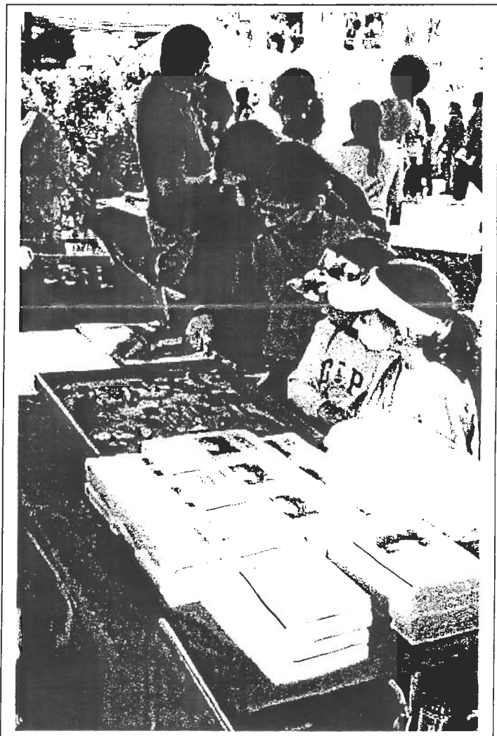
Photo: students and families examine artifacts at the ASSF display table.